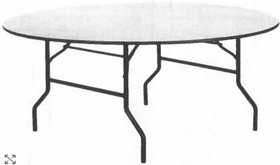
Round Supawood Table 1.8m